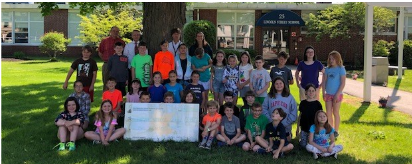
Winner of the 2018 Tucker Mountain Challenge, the 4th grade classroom at Lincoln Street School.